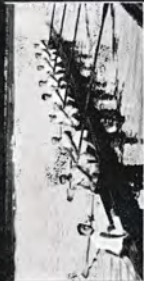
Champion Eight of Victoria 1908 Silver Eight, Rowing Regatta