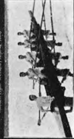
Master's Eight, Victoria Regatta, 1908