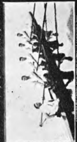
Rowing Regatta, 1907 Rowing Regatta, 1908