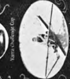
Yarra Challenge Cup