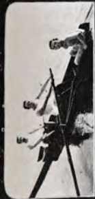
Sculler Pair, Tachewy Bay, 1907