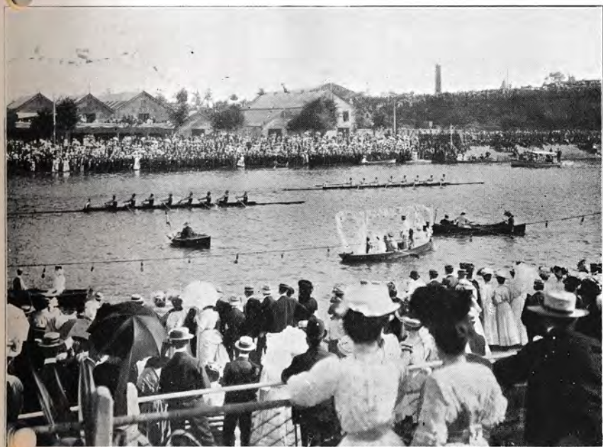
FINISH FOR GRAND CHALLENGE CUP, HENLEY 1907.

The South Australian and Tasmanian crews were housed at your shed, and after the race the members of the Tasmanian crew and their supporters donated the sum of six guineas to your club's funds for the purpose of providing trophies for a race during the ensuing season. The donation was suitably acknowledged, but we desire to record herein our appreciation of the kindly spirit which prompted the gift.