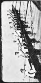
Grand Challenge Cup Rowing Regatta, 1907