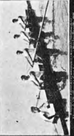
Rowing Regatta, 1907 Rowing Regatta, 1908