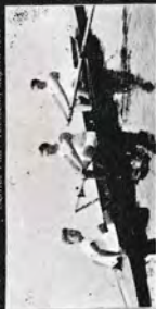
Rowing Pair, Jilwer Yarra Regatta, 1908