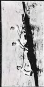
Master's Pair, Rowing Regatta, 1908