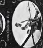
Grand Challenge Cup