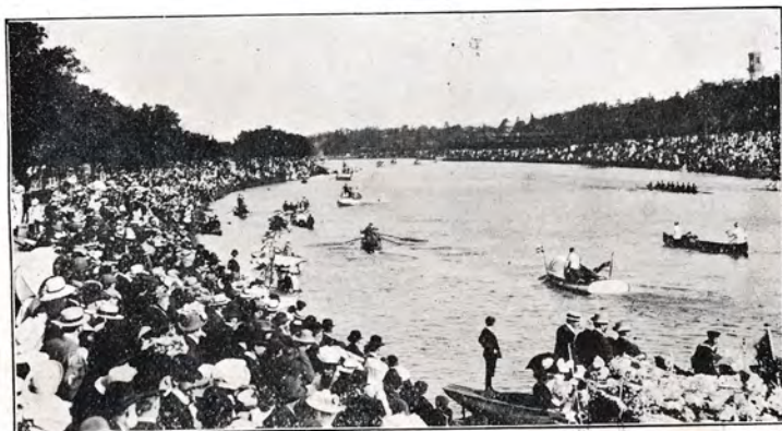
Regatta Course, River Yarra.