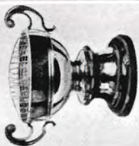
WINNING CREWS & TROPHIES 1919-20 SEASON