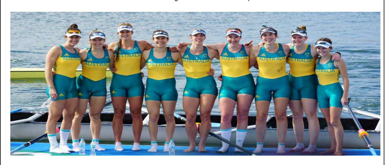
Mercantile Rowing Club – 136th Annual Report